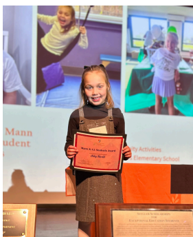
Abby School & Community Activities