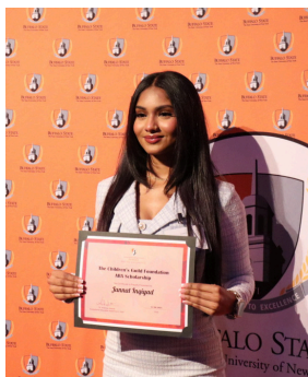
Jannat Inqiyad Applied Behavior Analysis